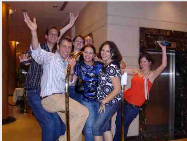
YPMTF07 participants having fun

In addition to the preparation of a formal presentation, the YPMTF program represents an opportunity for participants to network, make new friends around the world, and establish a network of professionals within the FIDIC community. An YPMTF alumni network will be established on the ypf webpages of FIDIC website.