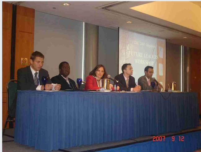
Future Leaders Workshop Presentation, Singapore 2007

The program is called the Future Leaders Workshop. It is attended by senior members of the FIDIC community, as well as junior and emerging leaders, for the opportunity to hear the voice of Young Professionals' regarding the emerging trends in the industry and the future of our professions.