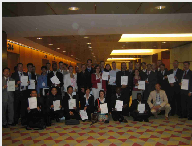
YPMTP-2007 participants holding their Certificates